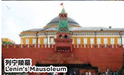
列宁陵墓 Lenin's Mausoleum