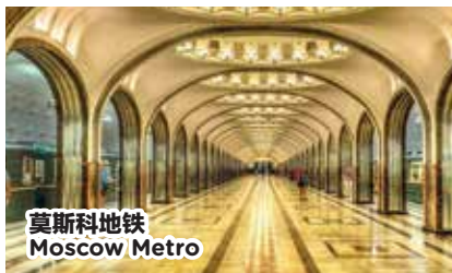
莫斯科地铁 Moscow Metro