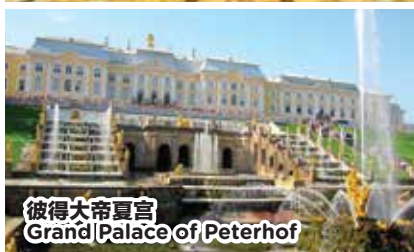
彼得大帝夏宫 Grand Palace of Peterhof